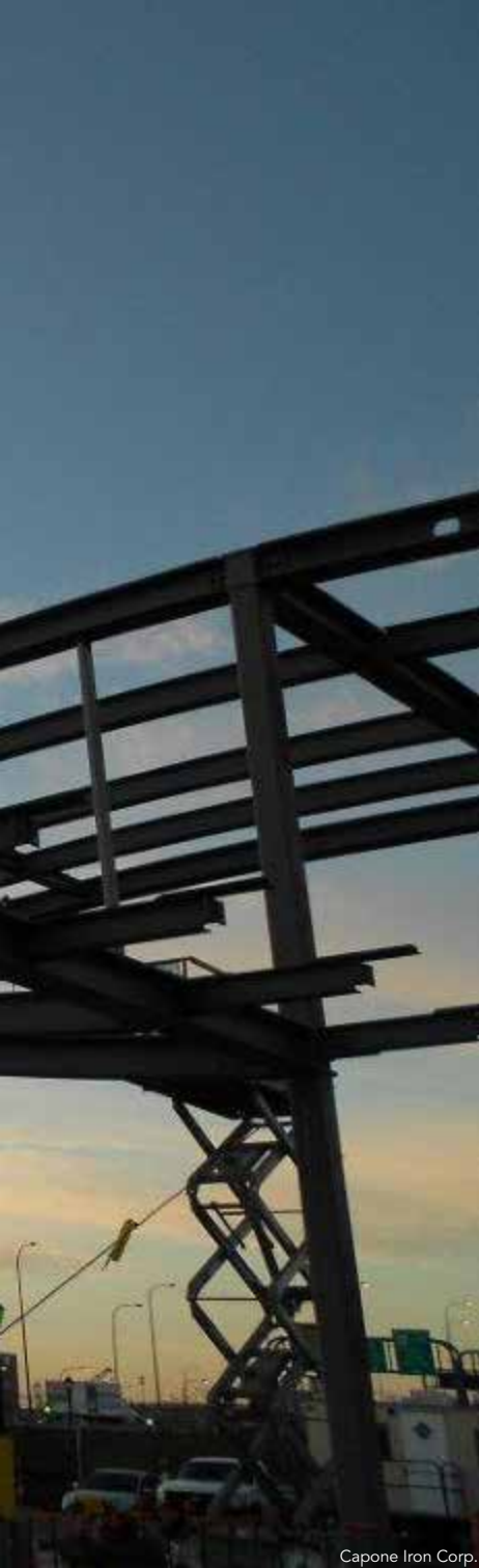
Capone Iron Corp.