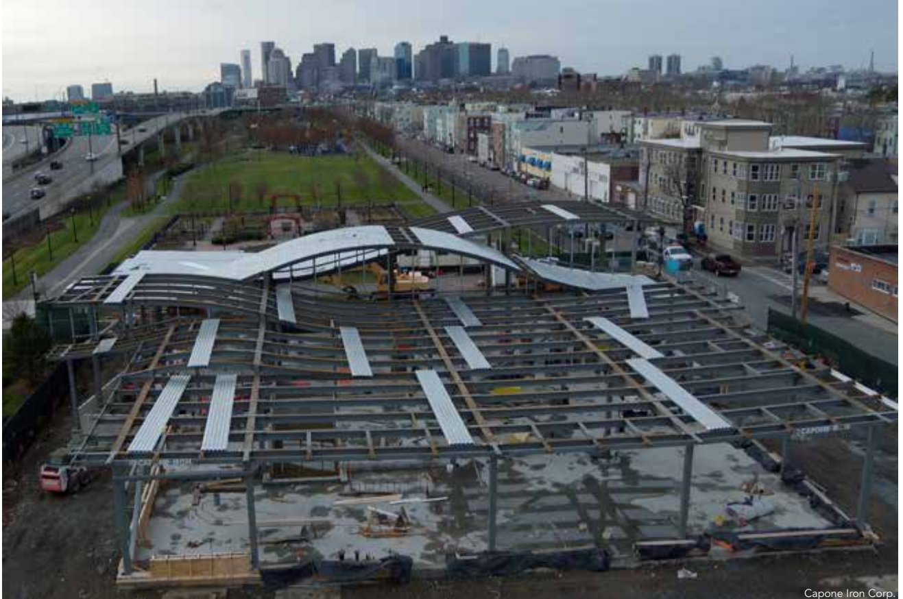
Capone Iron Corp.