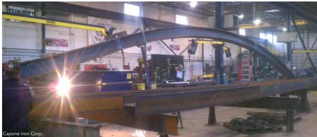
Capone Iron Corp.